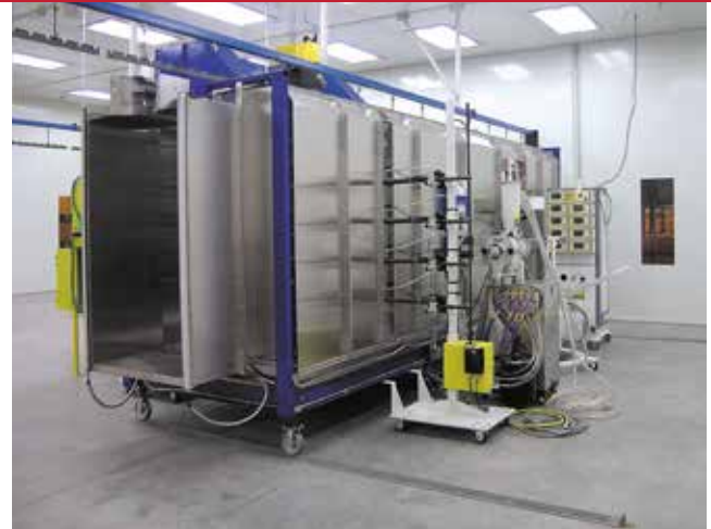
Custom designed booth openings such as operator shields and touch-up windows create a safe and efficient working environment.